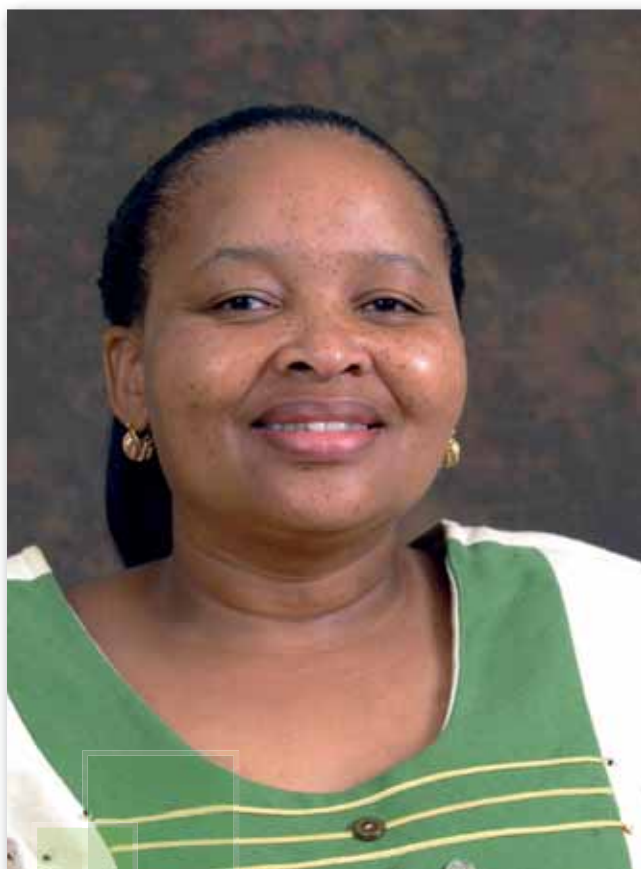
Ms Lulu Xingwana (MP)

An issue that is also a serious concern is to provide quality food to South African citizens. It remains a priority to ensure that animal and plant products are disease free in the interest of protecting public health. Sanitary and phytosanitary controls and inspections included the strengthening of disease surveillance systems and improving controls at all our border posts.